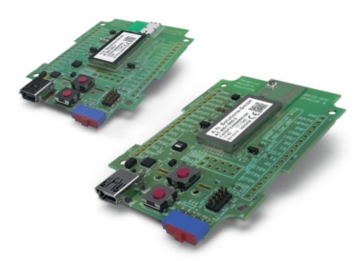
Mechanical module size 68.5 x 46.5 x 5 mm

Our Smart MAC Suite AT-command-based firmware and the included application examples guarantee a quick bring-up.